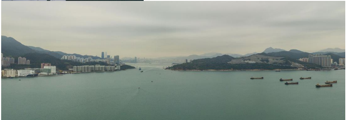
Arriving at Hong Kong Victoria Harbour, East entrance.

Hong Kong Institute of Urban Design Limited